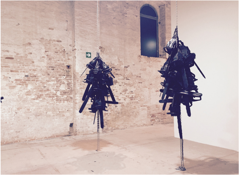
Figure 6. Monica Bonvicini, Latent Combustion , 2015.

that the modern drive forward and postmodern fragmentation were always already dialectical accomplices and that Benjamin leverages the dialectic into a radicalized state of irretrievable meaninglessness. If Hegel characterized the modern condition as an opposition between the prose of modernity (the linguistic mode of economy, bureaucracy, science, and philosophy) and the failure of romanticism (symbolism as the mind trapped inside itself, unable to exteriorize and realize itself as representation), he equally leveraged from this opposition the possibility of a modern imagination with a figurative faculty: a form of reason that is captive within the exteriority of representation, sealed up in exteriority, a “thing of reason.” From this, Rancière opposes two fantasies of reason: a “bad” one in which reason is simply anachronistic and anarchical, and a “good” one, in which reason is sealed in its prehistory, a lateness that is also an anticipation of interpretation, reading, deciphering. 21 Thus can we understand