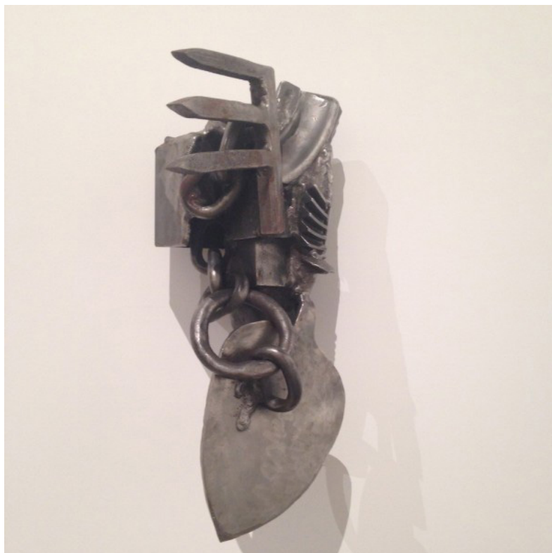
Figure 5. Melvin Edwards, Texas Tale , 1992. Courtesy of the artist.

Monica Bonvicini likewise created two sculptural amalgams for her Latent Combustion (2015) (Figure 6). Here, a grouping of chainsaws and leather straps were cast in concrete and covered in black liquid rubber, and then hung by chains from the ceiling. Though the chainsaws are perhaps among the most threatening and distinctly masculine of tools, nevertheless, the layout suggests an erotic overlay inspired as it is by the mise-en-scène of S&M sex clubs, so that the suspended grouping of tools is yielded to a libidinally charged probing of the objects' potential energies, rather than their direct deployment in the context of capitalist production or exploitation. The title of the