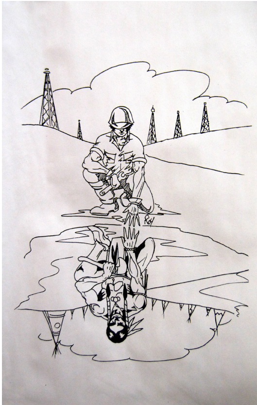
Figure 1. Anonymous, Indigenous Oil Worker (c.2008)

it? This idea of compensation is at the heart of such a decision, since the damages created by tar sands extraction are obvious to anyone who lives in their vicinity, and the remaining question is whether or not one might receive enough other benefits to still make the choice worthwhile.