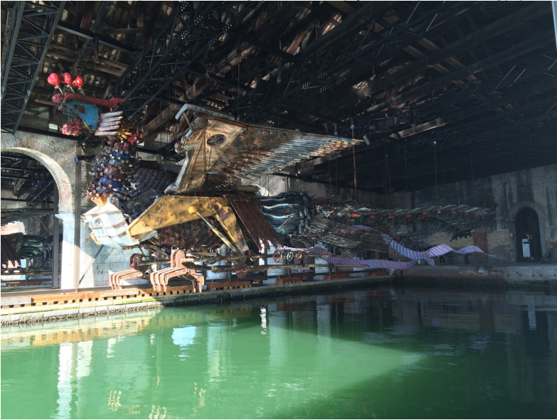
Figure 4. Xu Bing, Phoenix , 2015, construction site debris and materials, exhibited at the 56th Venice Biennale, Theme Exhibition, All World's Future, Venice, Italy, 2015. © Courtesy of Xu Bing Studio.

is clear: the era of manual labor and its energies has been buried and encrypted in the bedrock of the earth itself, a tactic of containment in the era of finance capital. Yet, the remnants of labor return as petro-objects, artifacts of that buried labor. Moreover, it is not coincidental that the tools of labor qua archaeological object appears in an age when extractive technologies provide the global economy's most lucrative resources (fracking for oil and natural gas as well as mining). The staging of an excavation of the remnants of another era of labor signals the rendering inert of labor and its burial as the wasted remains of modernity. Moreover, these excavations make apparent the containment of labor as potential energy. (I would go so far as to describe labor power as a petro-fuel in its own right.) In this sense, the return of manual tools as art encompasses the formation of the labor class in the global economy as both an archaic energy source, and one