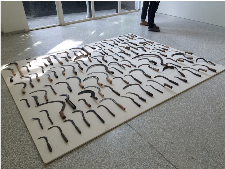
Figure 3. herman de vries, sickles from to be all ways to be , Venice Biennale, 2015. Courtesy of the artist.

Armpit presents an exclusively male world and yet even masculinity is laid bare as a subject formation in its obsolescence. The garage men combine a historical form of artisanship, with an equally long history of manual labor to make a new formation — a tinkerer who appropriates architectural structures in their demise and uses them for nonproductive labor. The wood fragments that make the scaffolding of the pavilion hark on the Latvian woodshed, and thereby suture the figure of the garageman with the tradition of artistic training in Latvia by which students would take over woodsheds as studios to train in plein air painting. Thus, the woodshed space sutures together the men's nonproductive manual work and the aesthetic sensibility for archaic spaces and tool-working.