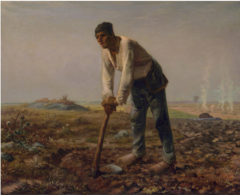
Figure 1. Jean-François Millet, Man with a Hoe , 1860 – 1862, Oil on canvas, 81.9 × 100.3 cm (32 1/4 × 39 1/2 in.). The J. Paul Getty Museum, Los Angeles.

revolutionizing or negatively as exploitative, and that these choices are energetically charged (positively by hope or negatively by anger), he locates the possibility of rearticulating the mechanisms of that system through precisely these political energies. That is to say, the seemingly magical process of deranging capital into interest-bearing capital can be undertaken as a representational procedure by which labor is inverted from its positive energies to its negative ones. A consciousness of the labor substructure thus occurs through the energetic derangement of representing capital. Moreover, such derangements of representation are ways of tracking shifts in forms and modes of political resistance, in addition to the technical composition of what we might term the fossil-fueled exploitation of