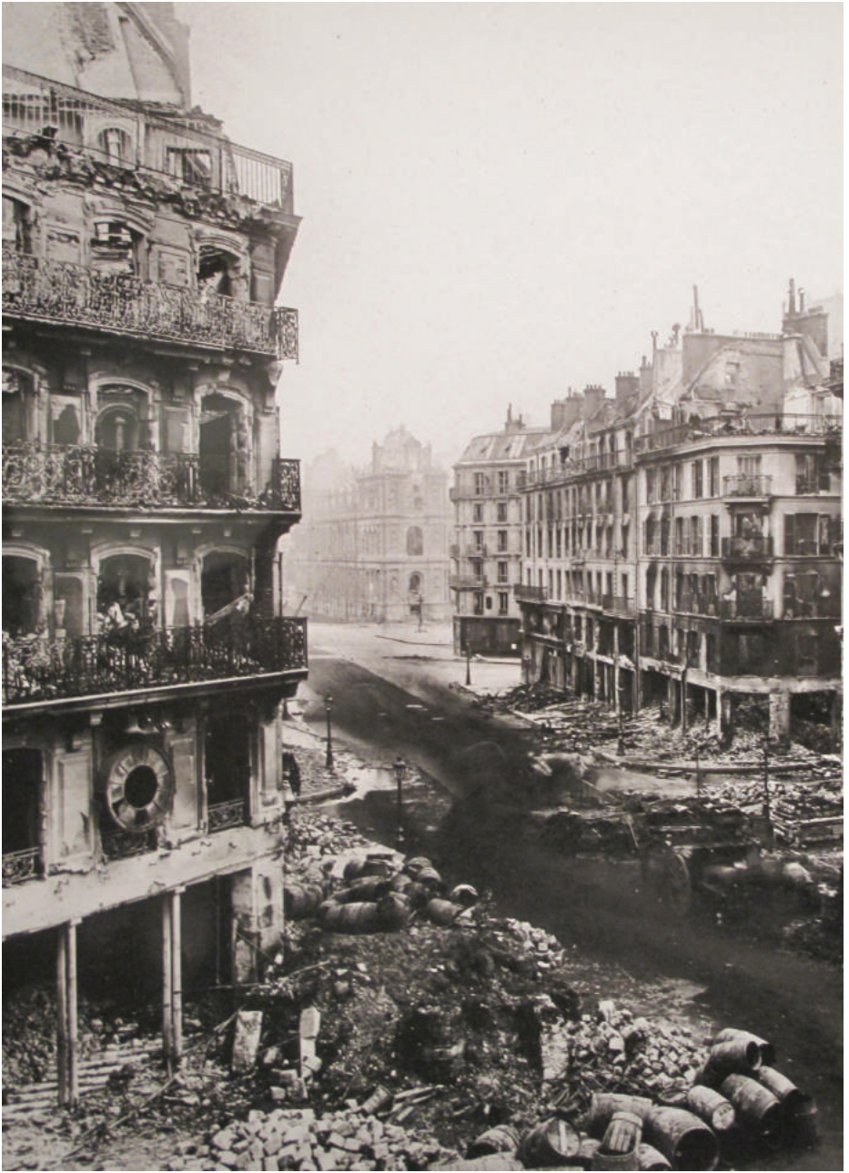
The rue de Rivoli after the fights and the fires of the Paris Commune